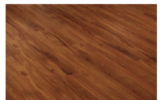
[NOX MCT™ LVT]