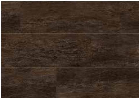
DYB8-3040 / DYB12-3041 / DYBT-3042 BARK