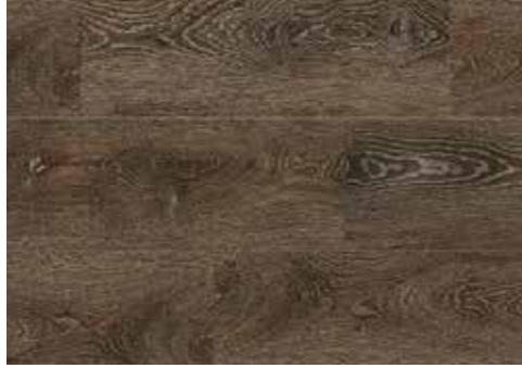
DYB8-2030 / DYB12-2031 / DYBT-2032 MEADOW OAK