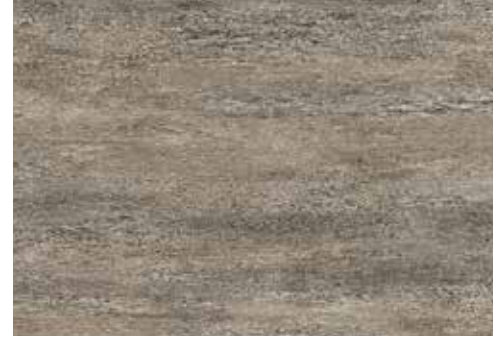
DYB8-1020 / DYB12-1021 / DYBT-1022 PEBBLE STONE