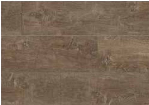
DYB8-2010 / DYB12-2011 / DYBT-2012 SAHARA