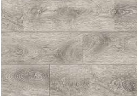
DYB8-1010 / DYB12-1011 / DYBT-1012 WHITE OAK