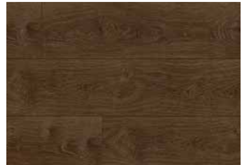
DYB8-3030 / DYB12-3031 / DYBT-3032 RIDGE WOOD