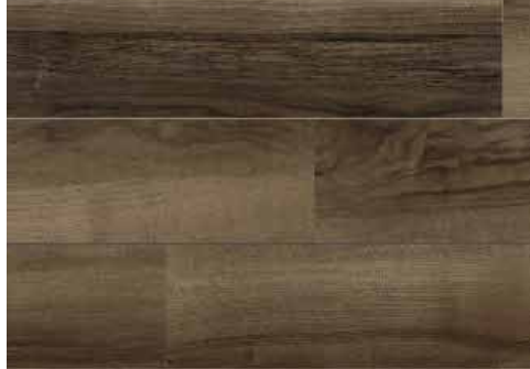
DYB8-3020 / DYB12-3021 / DYBT-3022 VALLEY