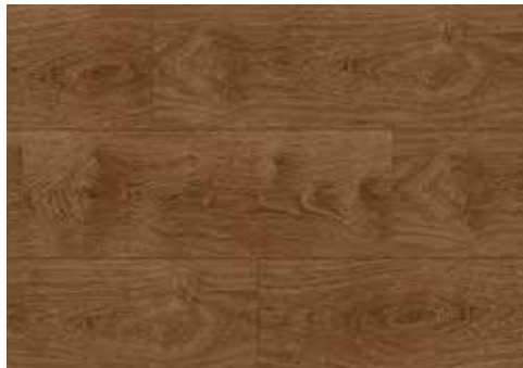
DYB8-2020 / DYB12-2021 / DYBT-2022 OAK WOOD