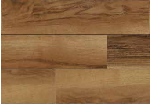
DYB8-1030 / DYB12-1031 / DYBT-1032 DESERT