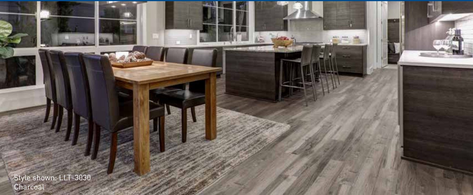
Style shown: LLT-3030 Charcoal