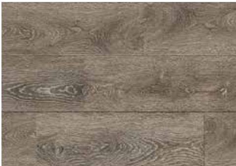
LLT-2010 ANTIQUE OAK